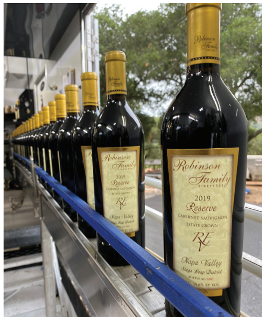
Out of the barrel, into the bottle!