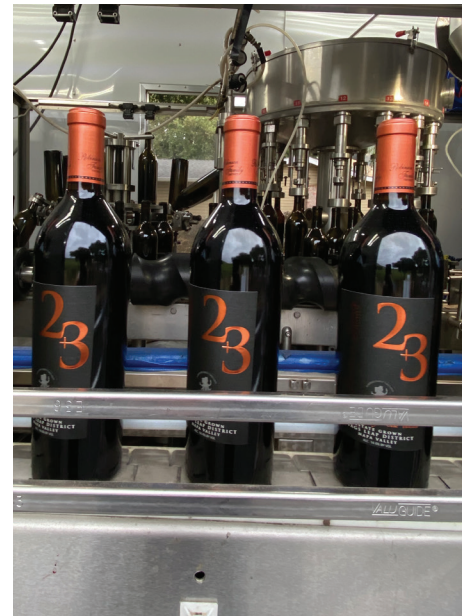
Another 2019 wine now in bottle.